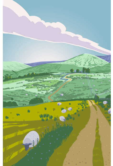
Illustration based on a photograph by Joan Martin/Photo North

Bounded by the rivers Wyre and Lune, the fells that dominate the skyline above the historic city of Lancaster are the highest in the Forest of Bowland, and while rugged scarps like Clougha Pike and Tarnbrook Fell offer exhilarating fell-walking opportunities, it's the intimate valleys of Roeburndale, Hindburndale and Grizedale which reveal a gentler side to the elemental upland landscapes of Bowland.